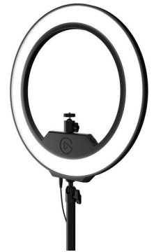
Table stands that can be attached to the tabletop with the help of a clamp are suitable for use at home ( example ). Similar table stands are also available for smartphones. There are also special smartphone holders that can be used to attach smartphones to common camera tripods. Some manufacturers also provide their mounts with the appropriate thread size so that they can also be attached to microphone stands.

first need to be connected to a so-called interface with a microphone cable. The interface is then connected to the PC or smartphone either with a USB cable or with an audio cable ( example ). Some USB microphones already have small stands built in. Other microphones require extra stands.